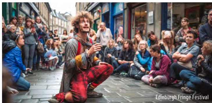
Edinburgh Fringe Festival

Today we travel, by coach, to Edinburgh, Scotland. On the way visit England's beautiful Lakes District, including the charming villages of Windermere and Bowness. Afternoon: Arrive in Edinburgh – one of Europe's most beautiful & historic cities. While we are there, the city will be hosting the spectacular Royal Edinburgh Military Tattoo, and the colourful Fringe Festival. Evening: Explore the colourful Fringe Festival activity, in the streets of Edinburgh. You may like to attend a Fringe Festival concert (optional). Overnight: Accommodation to TBC (to be confirmed). (B)