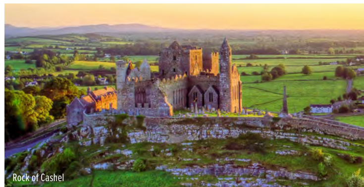
Rock of Cashel