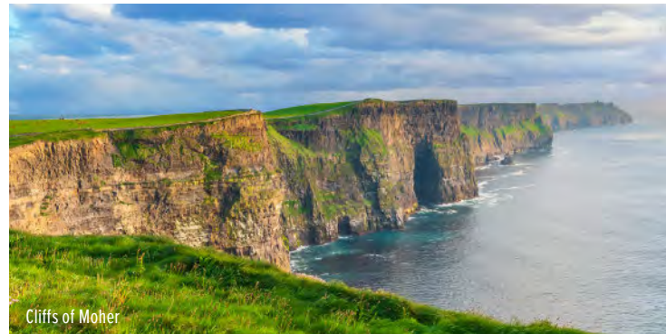
Cliffs of Moher

Travel south to Galway. On the outskirts of Westport see Croagh Patrick (a mountain, famous for an annual religious pilgrimage). Then travel through an unforgettable valley we have discovered, as we make our way to the Connemara region – famous for its unique, rocky landscapes. Visit much-photographed Kylemore Abbey. Tour Kylemore's main castle-like building & outstanding Victorian Walled Garden. Take a 'back roads' coastal route to Galway, through some of the most beautiful parts of the Connemara. On arrival in Galway, see the Claddah region and sing Galway Bay. Evening: Explore Galway's renowned session pubs with John Howie and Brendan Scott. Overnight: Victoria Hotel. (B,MorningTea)