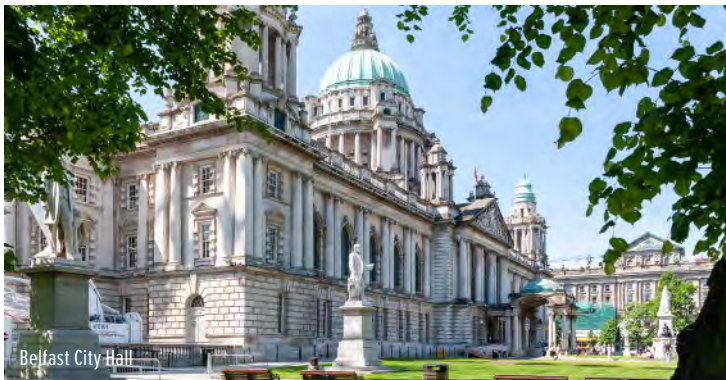
Belfast City Hall

Mid-day: Arrive Dublin Airport. Travel by coach to Belfast, Northern Ireland. Mid-afternoon: Check into our hotel, then free time. Overnight: Holiday Inn Express Belfast City.