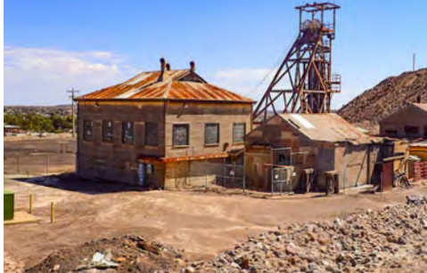
Old buildings at mining site in Broken Hill