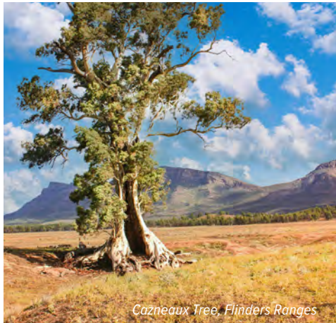
Cazneau Tree, Flinders Ranges