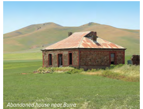
Abandoned house near Burra

This morning we travel south, heading for the Barossa Valley. Along the way we visit historic Burra, once a booming copper mining town. After a tour of the town you may like to sample one of the delicious local Cornish pasties, for lunch. Continue on to the Barossa Valley, one of Australia's premium wine growing regions. After a panoramic tour of the district we will visit a well-known winery. Then check into our accommodation, in Nuriootpa, one of the Barossa's main towns. Evening: Enjoy a performance by excellent local 'German' band, Über Oompah. The Barossa Valley, with its German heritage,