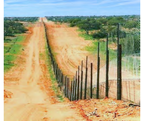
Dingo Fence, outback South Australia

Morning: Visit Burke's Grave and the beautiful Cullyamurra Waterhole, both a few kilometres east of our hotel. The scenery along Cooper Creek, in the vicinity of Innamincka, is stunning. Beautiful water holes, fabulous gum trees, and lots of colourful Australian birds. Then visit the famous Dig Tree, where on May 22, 1861, Burke, Wills and King probably realised they were doomed. Afternoon: You will have some free time. You may like to visit the former Australian Inland Mission Hospital building, now a National Parks office and museum, located right next to our hotel. Late Afternoon: Further exploration of Cooper Creek. Travel to the west of our hotel, including a visit to King's Marker (marks the spot where King was found alive by a search party following the Burke and Wills expedition). Evening: Enjoy a fun-filled Aussie Campfire Singalong, in the beer garden of our hotel. We will invite the locals to join us. (B)