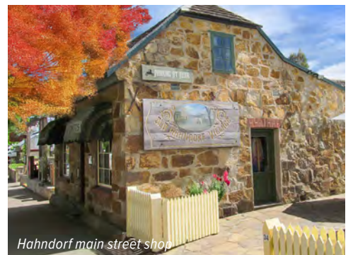
Hahndorf main street shop

Return to Melbourne, arriving approximately 6.45pm and the tour concludes. (B)